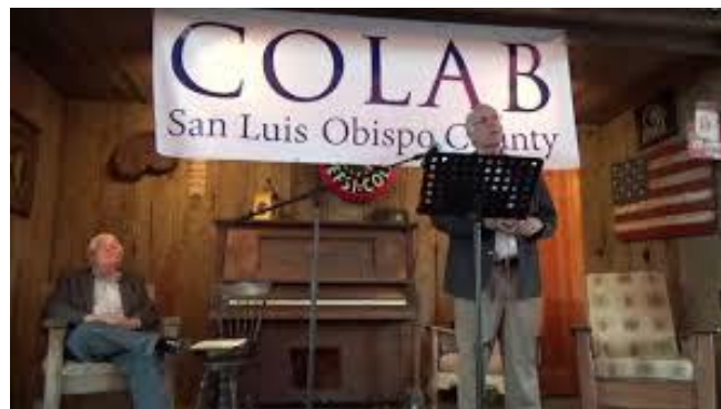
VICTOR DAVIS HANSON ADDRESSES A COLAB FORUM